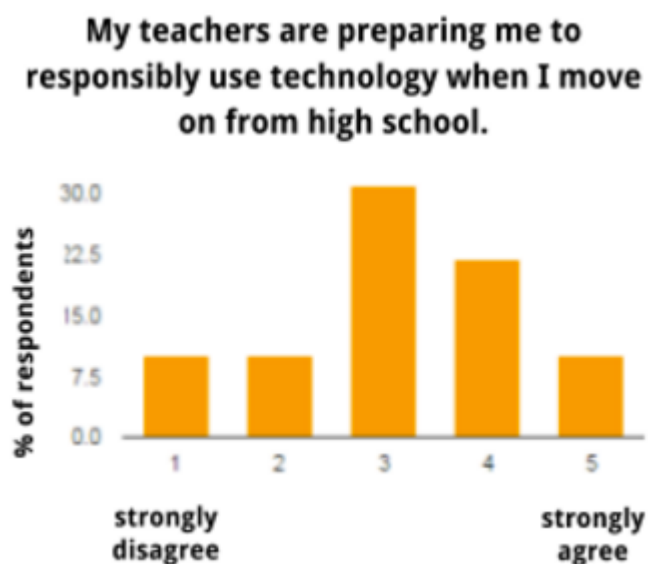
Figure 2: Students don't feel strongly that their teachers are preparing them to responsibly use technology in the future

strongly that their teachers were properly preparing them for that inevitability (Figure 2). One student recognized ways in which technology could make his work easier, saying, “Reading from a book requires far more time to find the information you need. With a computer, you can simply type what you need in the search bar and you get all the information that you need.” Other students expressed that they didn’t particularly enjoy working on the computer, especially when it came to reading, saying things like, “I am less distracted when I read actual books.” Students were generally upfront about the computer acting as a distraction to their learning, with 78.4% of students stating that they found themselves distracted by games and social media at least some of the time (Figure 3).