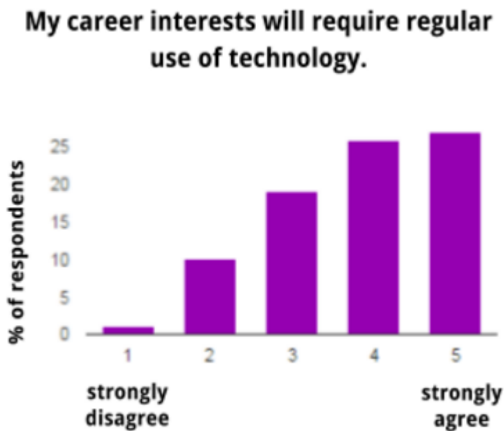
Figure 1: Students agree that technology will be important to future careers.

(or anywhere nearby). Because of this, those students pretty much only interacted with their devices at school. For some of them, their Chromebook was the first computer they had ever used. They were still struggling to learn how to type and how to use Google and I was expecting them to conduct research, write a response, and turn it in—all electronically and all in one period. It was just too much, too fast.