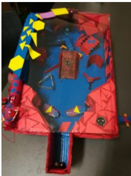
Figure 1. A cardboard pinball machine constructed by a student.

Marna incorporated a set of student-chosen science fair investigations about the forces in rubber bands, angles of ramp elevation, and friction on different surfaces.